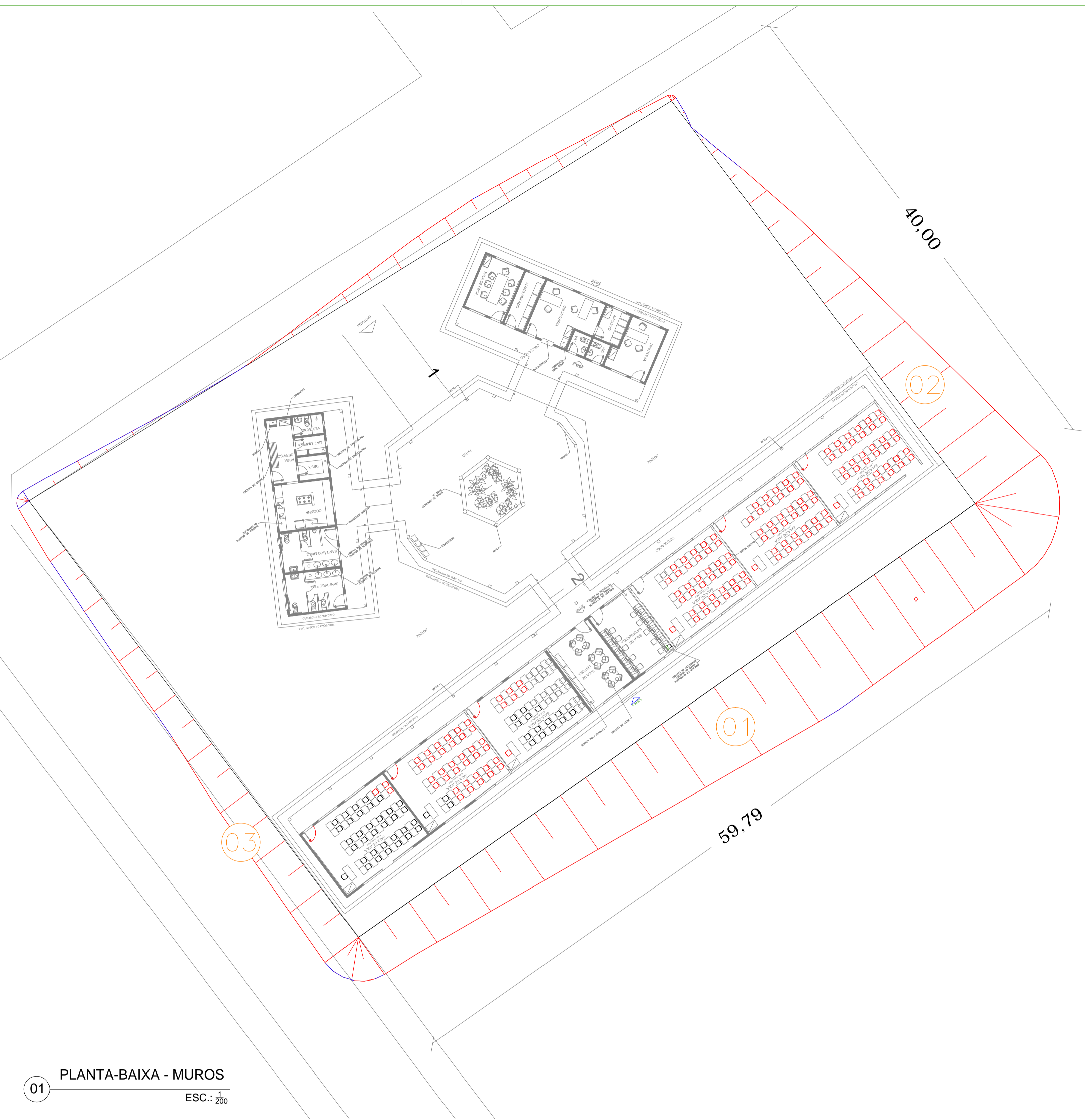
01 PLANTA-BAIXA - MUROS ESC.: 1/200